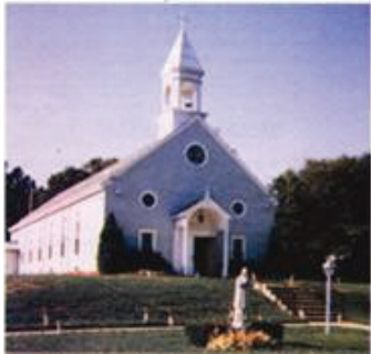
St. John Vianney Church 2901 Good Intent Road Deptford, NJ 08096