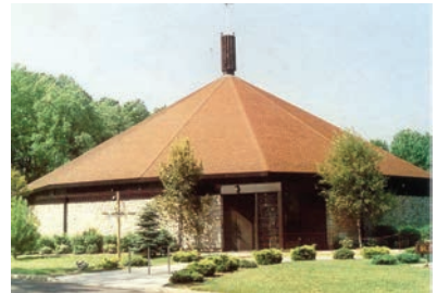
St. Margaret Church 845 Third Street Woodbury Heights, NJ 08097

Web Site: www.TheInfantJesusParish.org School Web Site: www.stmargarets-rs.org E-Mail: TheInfantJesusParish@comcast.net FAX: 856-384-8123