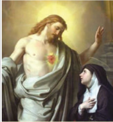
St. Margaret Mary Alacoque 1647-1690 Memorial - 16 October

Join us as we Worship and Adore Our Lord.