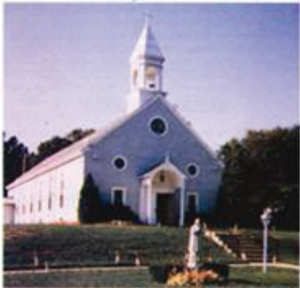
St. John Vianney Church 2901 Good Intent Road Deptford, NJ 08096