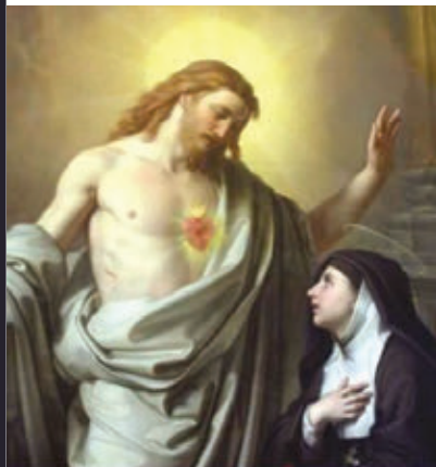
St. Margaret Mary Alacoque 1647-1690 Memorial - 16 October

Join us as we Worship and Adore Our Lord.