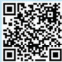
Athletic Virtual Open House