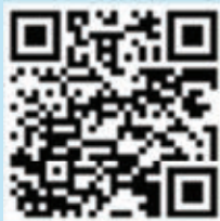
Virtual Open House

Visit Paul VI virtually! - Paul VI High School offers 3 distinct virtual experiences for interested families, each available with a click of the mouse! Visit www.pvihs.org to see our Virtual Tour, our Virtual Open House, and our Virtual Athletic Open House. Have your phone handy? Try your QR code reader instead!