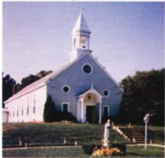
St. John Vianney Church 2901 Good Intent Road Deptford, NJ 08096