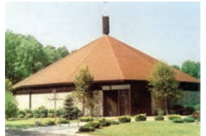
St. Margaret Church 845 Third Street Woodbury Heights, NJ 08097