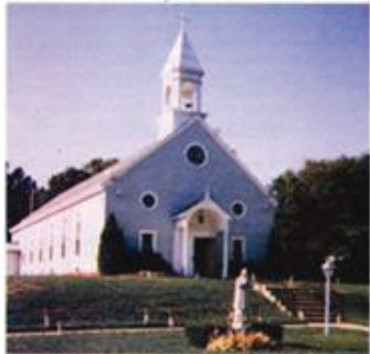
St. John Vianney Church 2901 Good Intent Road Deptford, NJ 08096