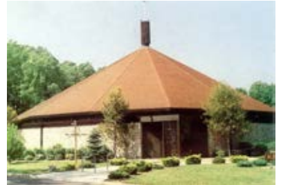
St. Margaret Church 845 Third Street Woodbury Heights, NJ 08097