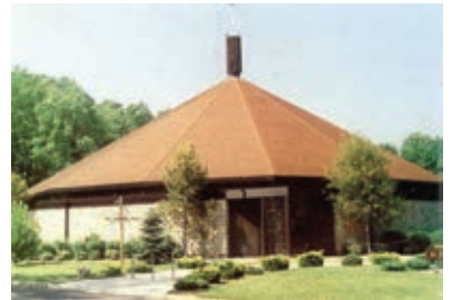
St. Margaret Church 845 Third Street Woodbury Heights, NJ 08097