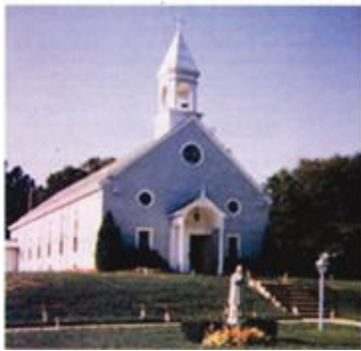
St. John Vianney Church 2901 Good Intent Road Deptford, NJ 08096