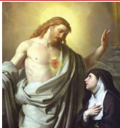
St. Margaret Mary Alacoque 1647-1690 Memorial - 16 October

* St. Margaret Church * St. Margaret Regional School * St. Margaret’s Knights of Columbus St. Margaret Mary Alacoque inspired the Devotion to the Sacred Heart of Jesus.