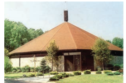
St. Margaret Church 845 Third Street Woodbury Heights, NJ 08097