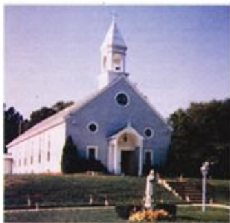
St. John Vianney Church 2901 Good Intent Road Deptford, NJ 08096