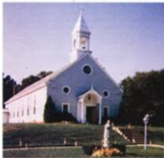
St. John Vianney Church 2901 Good Intent Road Deptford, NJ 08096