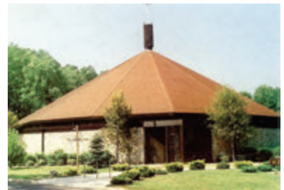
St. Margaret Church 845 Third Street Woodbury Heights, NJ 08097

Web Site: www.TheInfantJesusParish.org School Web Site: www.stmargarets-rs.org E-Mail: TheInfantJesusParish@comcast.net FAX: 856-384-8123