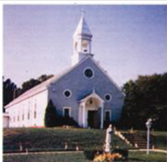
St. John Vianney Church 2901 Good Intent Road Deptford, NJ 08096