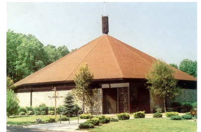
St. Margaret Church 845 Third Street Woodbury Heights, NJ 08097

Web Site: www.TheInfantJesusParish.org School Web Site: www.stmargarets-rs.org E-Mail: TheInfantJesusParish@comcast.net FAX: 856-384-8123