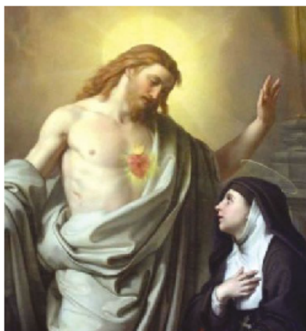
St. Margaret Mary Alacoque 1647-1690 Memorial - 16 October

St. Margaret Mary Alacoque inspired the Devotion to the Sacred Heart of Jesus.