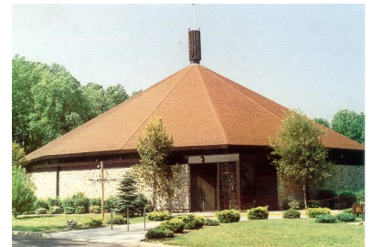
St. Margaret Church 845 Third Street Woodbury Heights, NJ 08097

Web Site: www.TheInfantJesusParish.org School Web Site: www.stmargarets-rs.org E-Mail: TheInfantJesusParish@comcast.net FAX: 856-384-8123