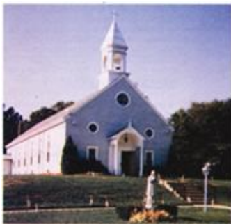
St. John Vianney Church 2901 Good Intent Road Deptford, NJ 08096