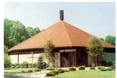
St. Margaret Church 845 Third Street Woodbury Heights, NJ 08097

Web Site: www.TheInfantJesusParish.org School Web Site: www.stmargarets-rs.org E-Mail: TheInfantJesusParish@comcast.net FAX: 856-384-8123