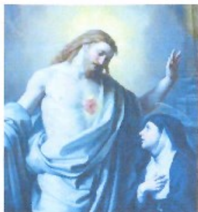
St. Margaret Mary Alacoque 1647-1690 Memorial - 16 October

Sponsored by St. Margaret's Knights of Columbus