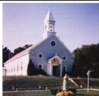
St. John Vianney Church 2901 Good Intent Road Deptford, NJ 08096