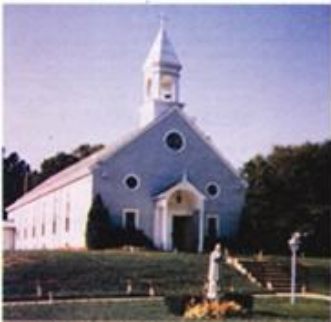
St. John Vianney Church 2901 Good Intent Road Deptford, NJ 08096