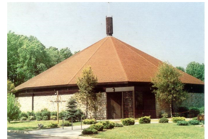
St. Margaret Church 845 Third Street Woodbury Heights, NJ 08097

Web Site: www.TheInfantJesusParish.org School Web Site: www.stmargarets-rs.org E-Mail: TheInfantJesusParish@comcast.net FAX: 856-384-8123