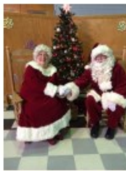
Mother & Daughter