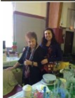
IJ Parish Clothing