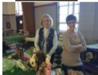
Kids Shopping Center