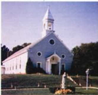
St. John Vianney Church 2901 Good Intent Road Deptford, NJ 08096