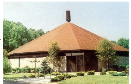
St. Margaret Church 845 Third Street Woodbury Heights, NJ 08097

Web Site: www.TheInfantJesusParish.org E-Mail: TheInfantJesusParish@comcast.net FAX: 856-384-8123