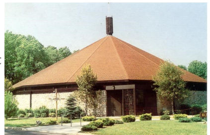
St. Margaret Church 845 Third Street Woodbury Heights, NJ 08097

Web Site: www.TheInfantJesusParish.org E-Mail: TheInfantJesusParish@comcast.net FAX: 856-384-8123