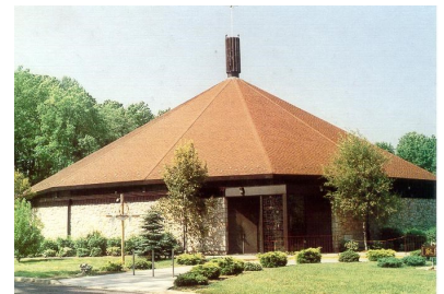
St. Margaret Church 845 Third Street Woodbury Heights, NJ 08097

Web Site: www.TheInfantJesusParish.org School Web Site: www.stmargarets-rs.org E-Mail: TheInfantJesusParish@comcast.net FAX: 856-384-8123