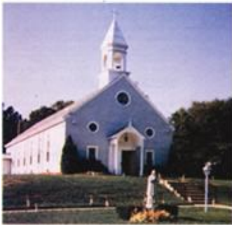
St. John Vianney Church 2901 Good Intent Road Deptford, NJ 08096