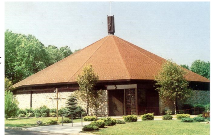
St. Margaret Church 845 Third Street Woodbury Heights, NJ 08097

Web Site: www.TheInfantJesusParish.org E-Mail: TheInfantJesusParish@comcast.net FAX: 856-384-8123