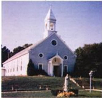
St. John Vianney Church 2901 Good Intent Road Deptford, NJ 08096