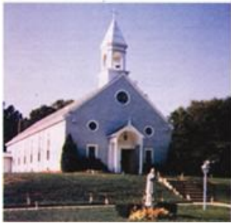
St. John Vianney Church 2901 Good Intent Road Deptford, NJ 08096