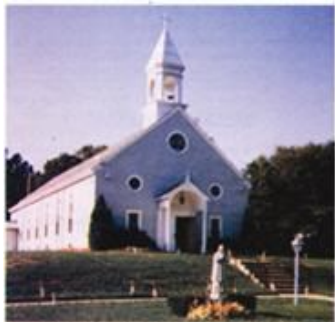
St. John Vianney Church 2901 Good Intent Road Deptford, NJ 08096