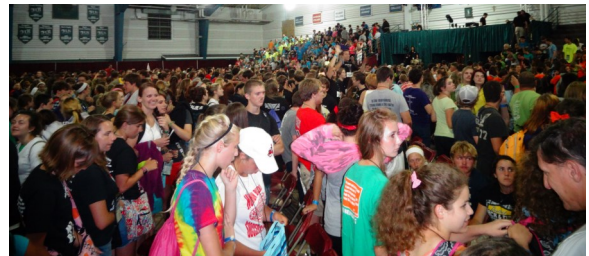
Steubenville High School Youth Conference! See the short video of our experience on our website!!

This year, the annual March for Life is being held on Wednesday, January 22 in Washington, D.C. YouthLife will be heading down again and also joining the huge Youth Rally that precedes the March. Join with over 20,000 other teens in the D. C. stadium who want to witness the Pro-Life message. We have also been given the incredible opportunity to participate in the Mass held during the Youth Rally!! We need teens who are willing to be lectors, gift-bearers, Rosary leaders, and someone to lead the Prayer of the Faithful said during Mass. A flyer with more information is available in the back of the churches by the literature rack, along with being online. Please fill out a permission form by January 10!